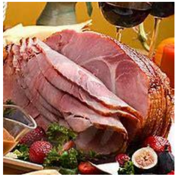
Ham for the HAMS.